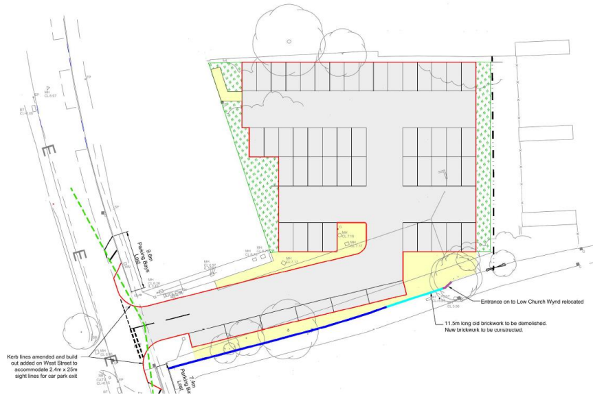
CURRENT PROPOSAL (LEFT)